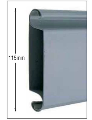
PROFILE: STEEL DIMENSION: 115 mm

width 115mm and ability to receive polyurethane or rock wool insulation. Ideal for industrial use in large outdoor openings. Type G 70 TWIN is delivered electrostatically painted in the shades of the main color index.